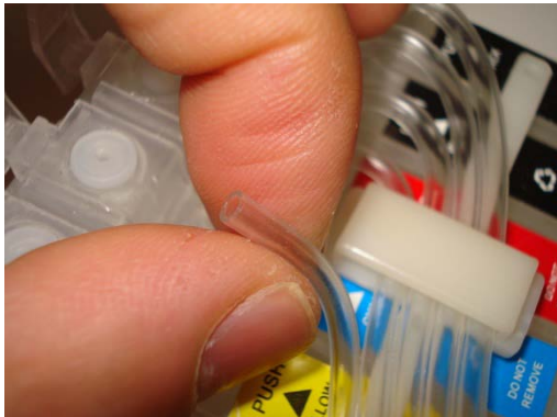
Take the broken part off the tube