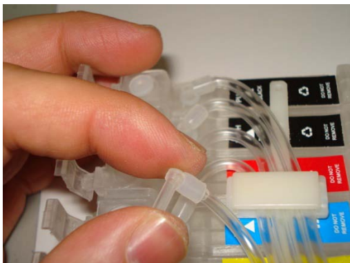
Put the new part into the tube