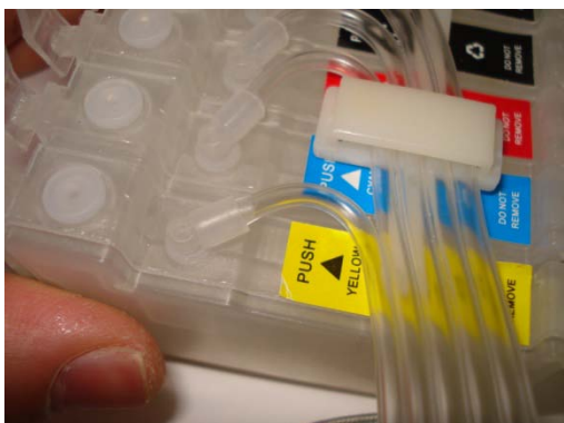
connect the 90 degree connect back to the cartridge